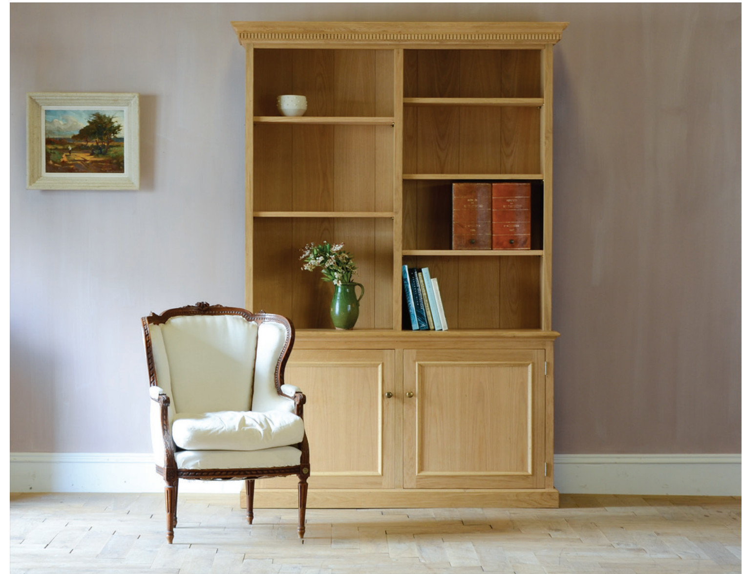
Provence bookcase with two bays and cupboards, white oak finish.