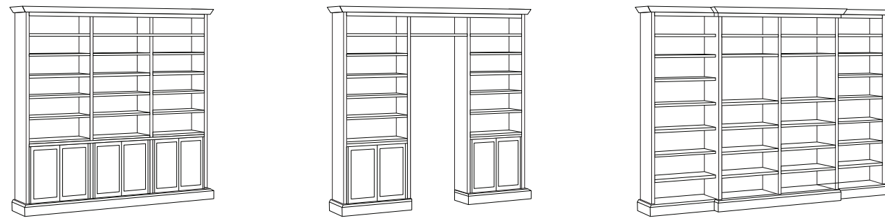
CUPBOARD & BOOKCASE