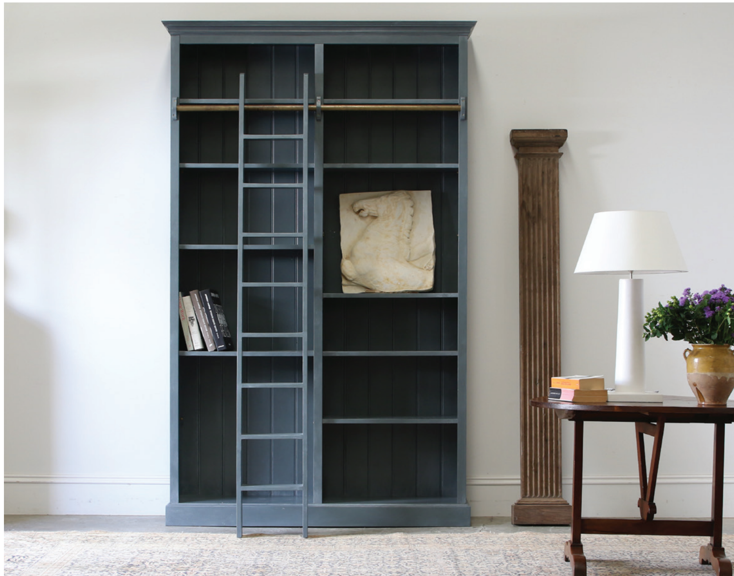
Library height, double bay bookcase painted in JS Eucalyptus.