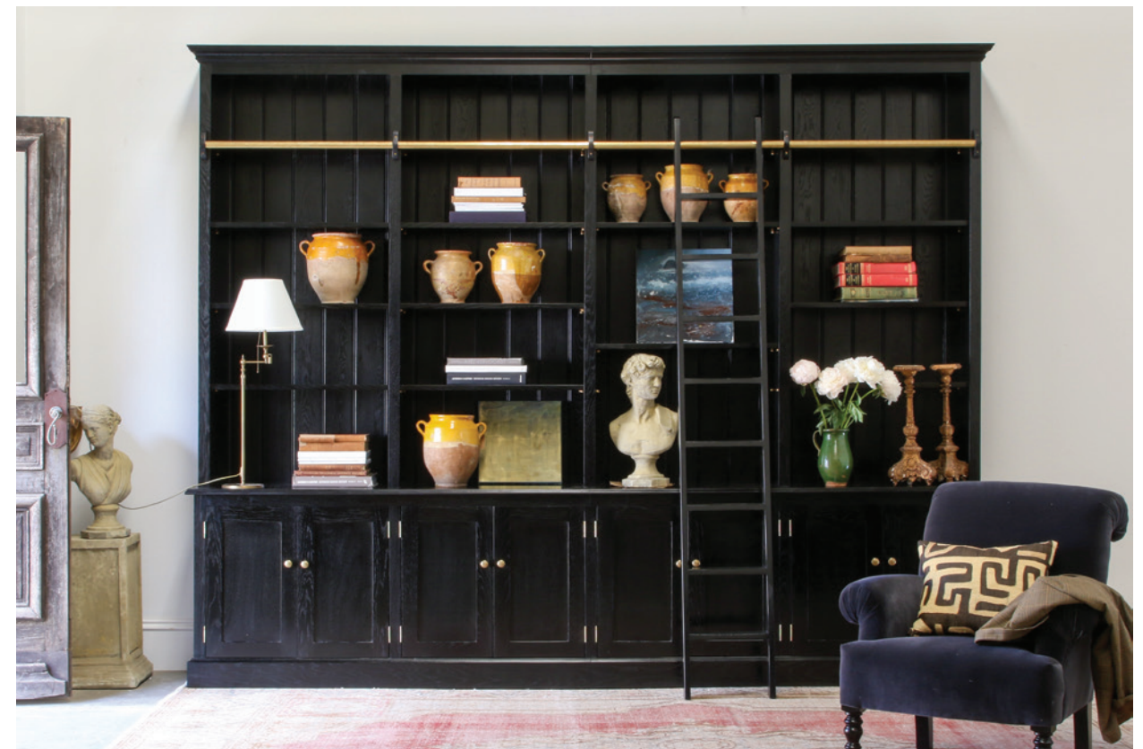
Classic four-bay bookcase with rail and ladder, plain fielded cupboards, finished in satin black.